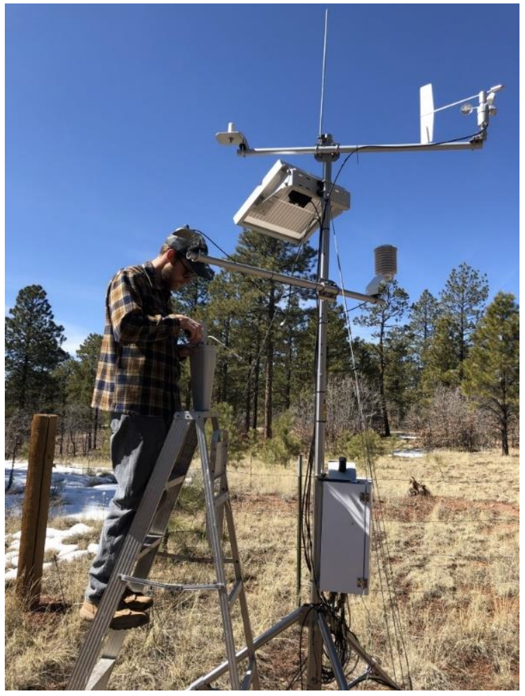
Photo 2: Sam Berry with The Forest Stewards Guild installs new antenna on the RAWS

The Forest Stewards Guild, through our Participating Agreement for monitoring in the CFLRP, contracted out 86 permanent plots installed within Mexican spotted owl (MSO) protected habitat. The purpose was to provide actual onthe-ground data to inform existing conditions and what, if any, treatments were needed to improve habitat and reduce fire risk. Previous data had been imputed using the nearest neighbor program. In addition, over 1,000 acres of Recovery Nest Roost habitat were assessed using quick plots to determine quality and diagnose potential treatments.